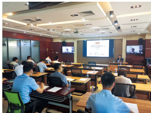
The second training 第二期培訓

Amendments to the Production Safety Law of the PRC and Key Implications 《安全生產法》的修訂及主要影響