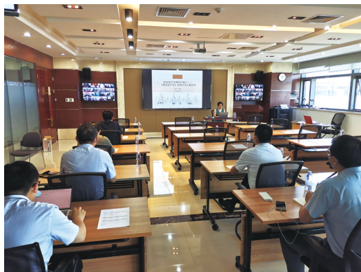
The first training 第一期培訓

本報告期內，本集團總部開展了安全生產培訓，主要培訓內容為《安全生產法》概述與修改重點及責任主體範圍和職責解析，並將「天津港8.12事故」和「煙台招遠2.17火災事故」等典型案例與《安全生產法》中強調的安全生產管理相關內容相結合，進一步補充講解和答疑。此培訓加強了員工的安全生產「紅線」意識和「底線」思維，為本集團安全穩定生產提供有力保障。